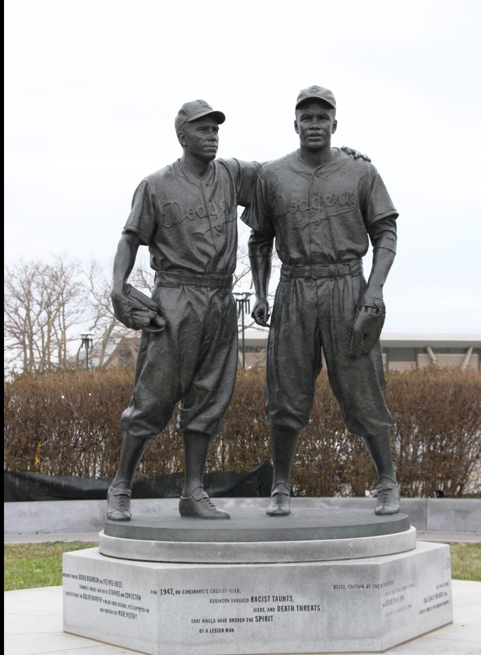
“Coney Island in Winter” by ShellyS is licensed under (CC BY-NC-SA 2.0)